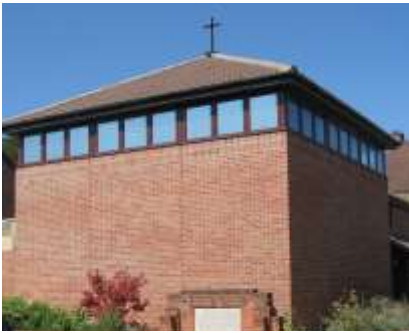
Ashford Methodist Church