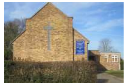
Laleham Methodist Church