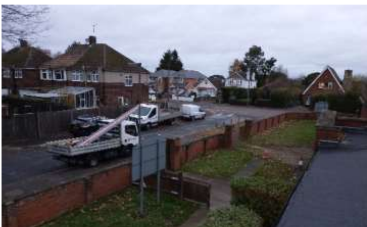
View from the storeroom roof on a chilly morning in November

Although the church building isn't being used as much as we might like, we're keeping on top of looking after it.