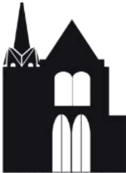
Christ Church Feltham