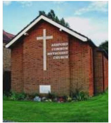
Ashford Common Methodist Church