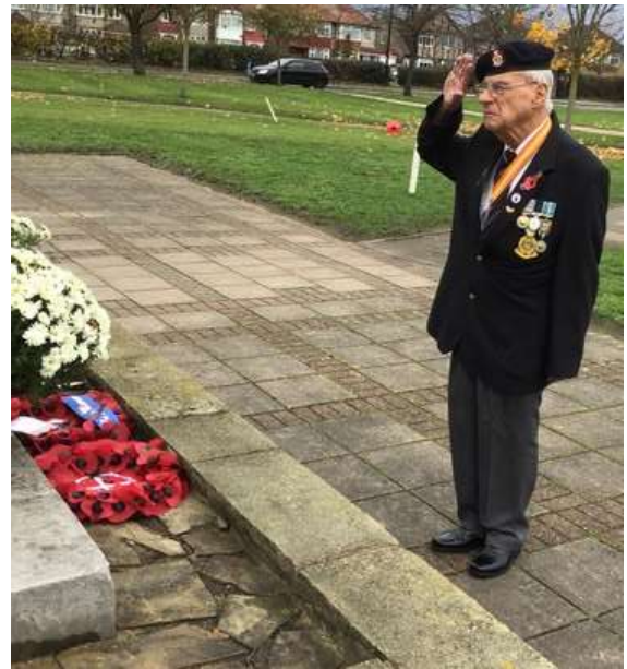
at Bedfont War Memorial on the 11 th November 2020

For me, war memorials are inevitably associated with cemeteries. When I was growing up, I thought that cemeteries were just places where people were buried after they had died.