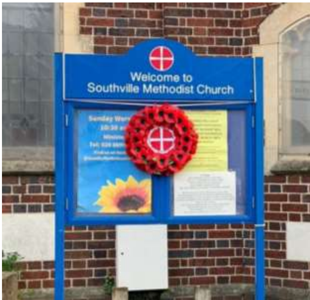
on 8 th November 2020 at Southville Methodist Church