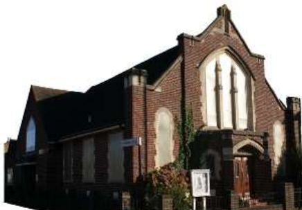
Southville Methodist Church