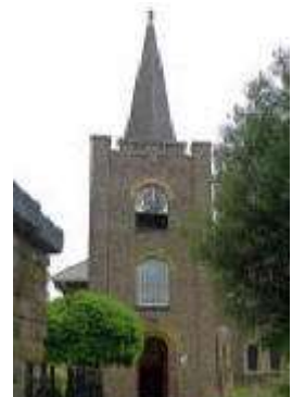
St Dunstan's Church