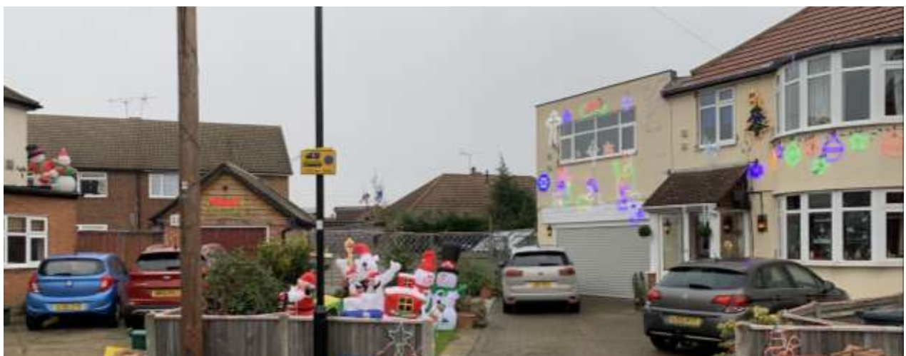
In place at 11/16 Walsham Road until Morning of 6 th January 2021