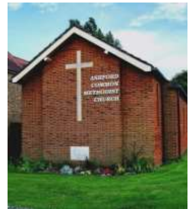
Ashford Common Methodist Church