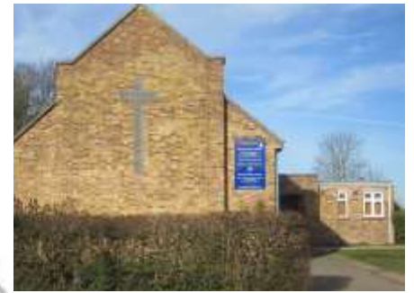
Woodthorpe Methodist Church, Edinburgh Drive