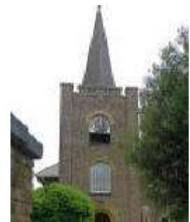
St Dunstan's Church, Feltham