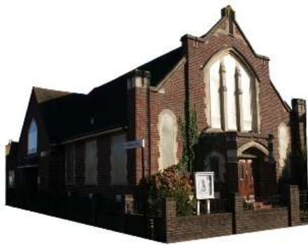
Southville Methodist Church