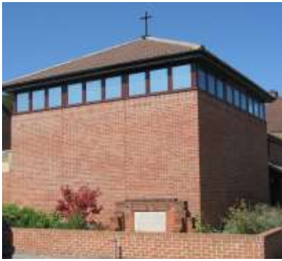
Woodthorpe Methodist Church, Clarendon Road