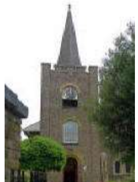
St Dunstan's Church