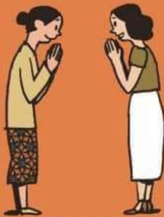
The Thai "wai"