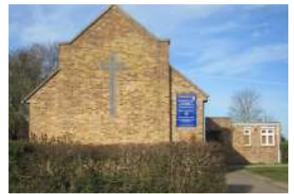
Laleham Methodist Church