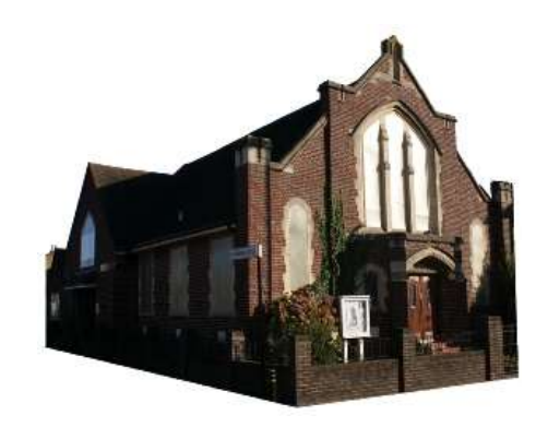
Southville Methodist Church