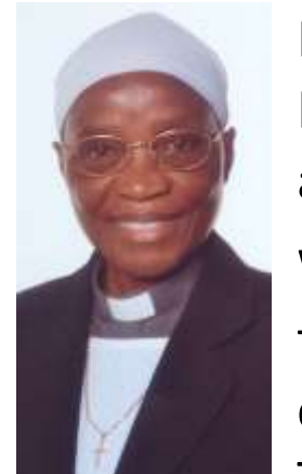
Dear Friends, I trust you had a blessed Easter with Family, relatives and friends.

We give thanks and praise to God Almighty that things were different, this year and we were able to celebrate Easter face to face in our church buildings. The Government restrictions to stop the spread of