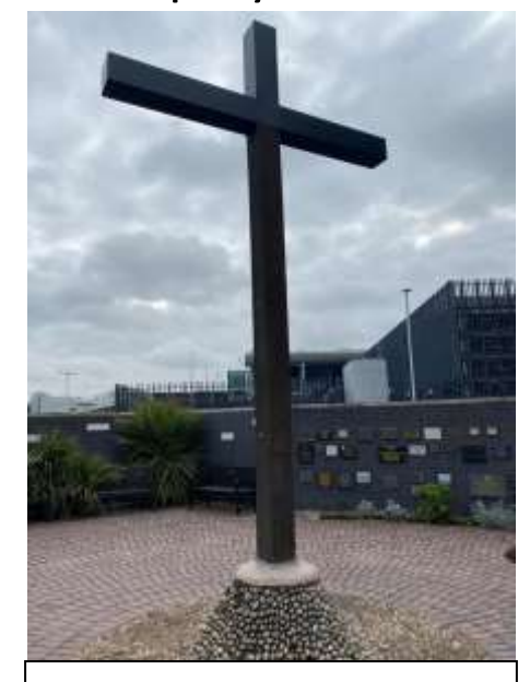
The top of the cross was knocked off by storm Eunice and a replacement made and installed by the workshop at Heathrow.

The two main worshipping communities on the airport are the Muslims and the Roman Catholics and they have been the hardest hit by the closure of the chapel and the prayer rooms as a result of the