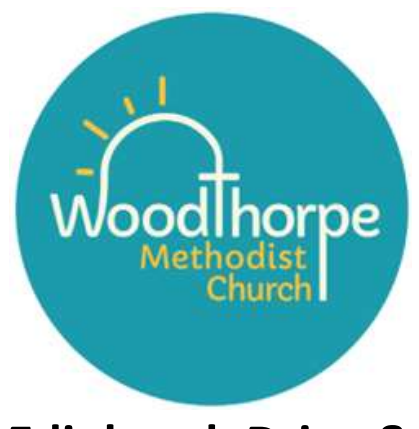
Edinburgh Drive & Clarendon Road