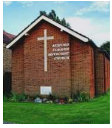
Ashford Common Methodist Church