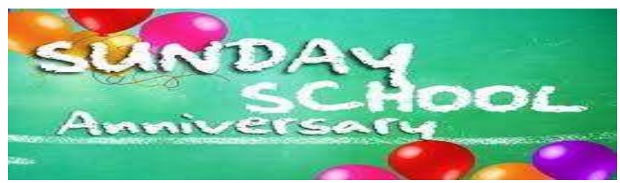
on 12<sup>th</sup> June

of years, this has been the service which we follow with a BBQ lunch in the Church garden. The entire congregation is invited to this and we hope you'll be able to stay and join us.