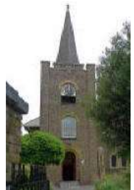
St Dunstan's Church