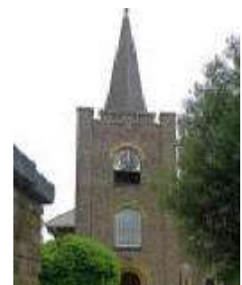
St Dunstan's Church, Feltham