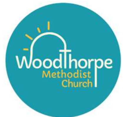
Edinburgh Drive & Clarendon Road