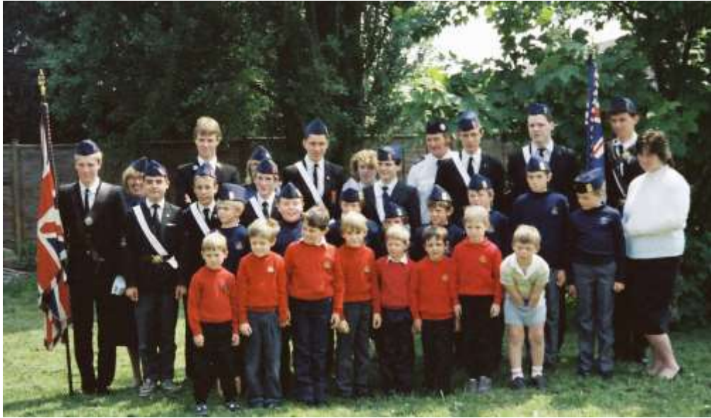
Our BB Company in the Church Garden in 1989