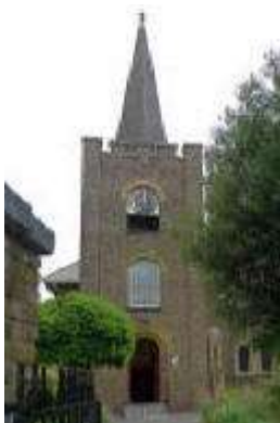
St. Dunstan's Church, Feltham