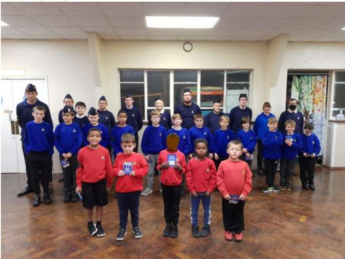
The Boys' Brigade at Ashford Common 4 October 2021

There have been some challenging times in the 58 years of our Company, none more so than the last couple of years when meeting in person would have been illegal. It's likely more than 1000 young people and their families have been touched by the work of The Boys' Brigade at Ashford Common. This has been achieved by successive generations of dedicated and enthusiastic leaders who continue to provide interesting, exciting and challenging activities for young people. The work continues today and this picture from October 2021 shows almost the entire Company.