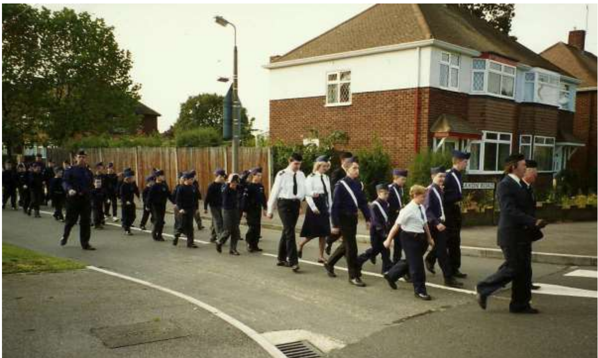
North Surrey Battalion Parades at Ashford Common