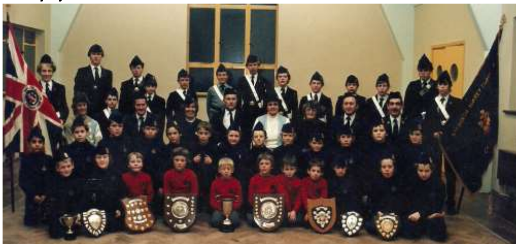
7th North Surrey during the BB Centenary year of 1983