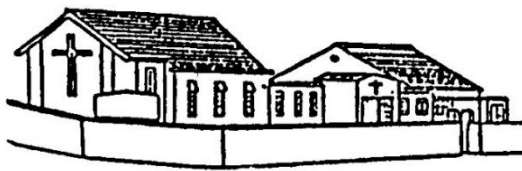
Ashford Common Methodist Church

Seeking to know God and to make God known to others