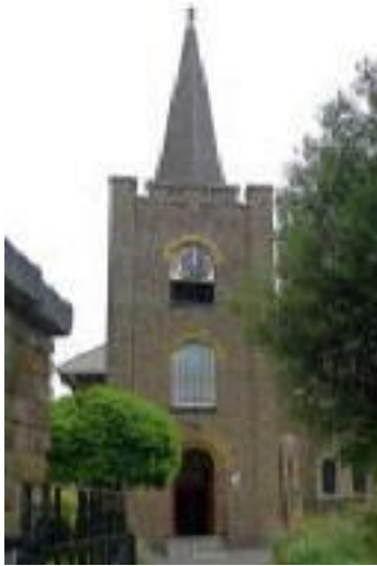
St Dunstan's Church Feltham