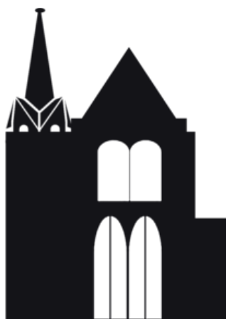
Christ Church Feltham