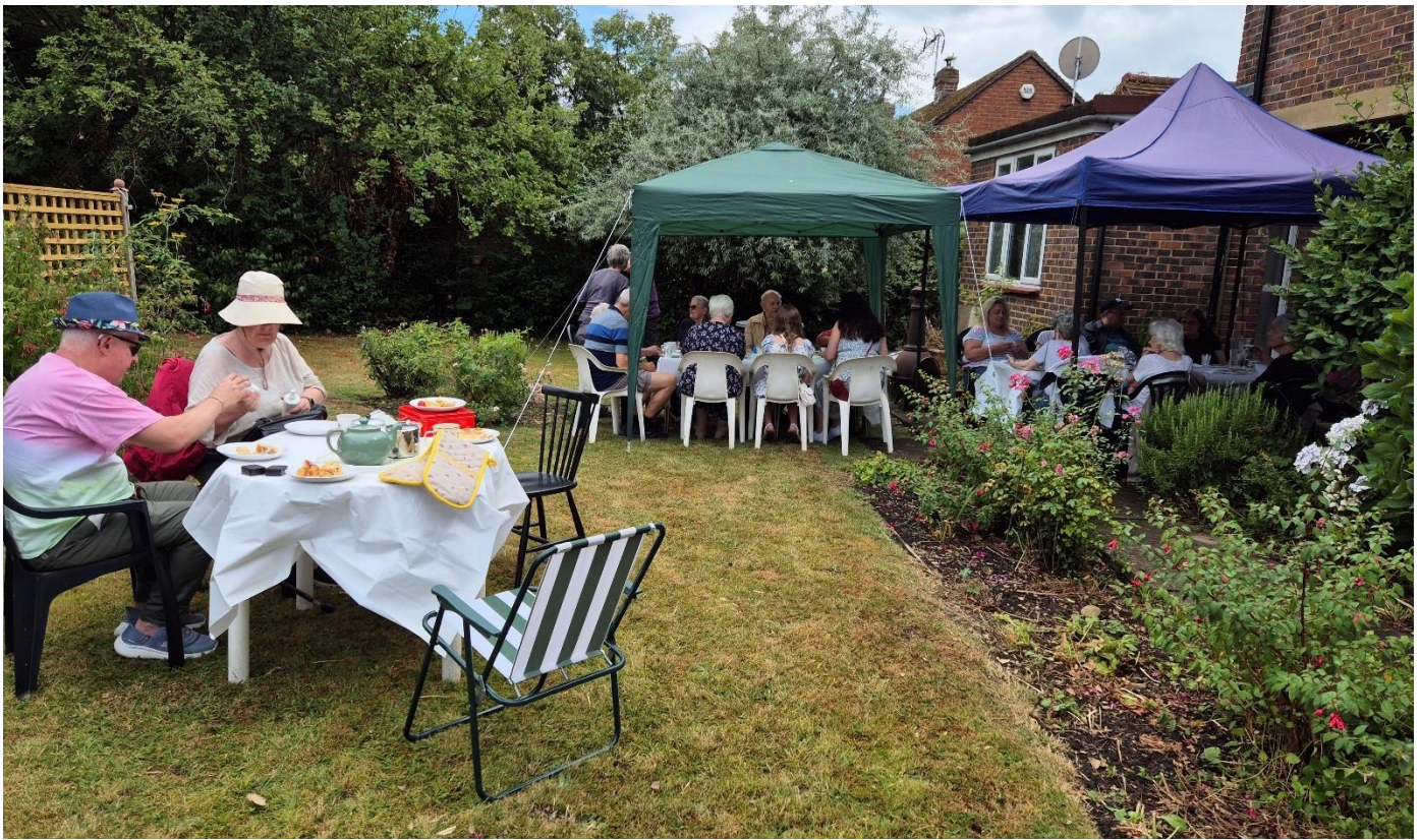
Cream tea at vicarage