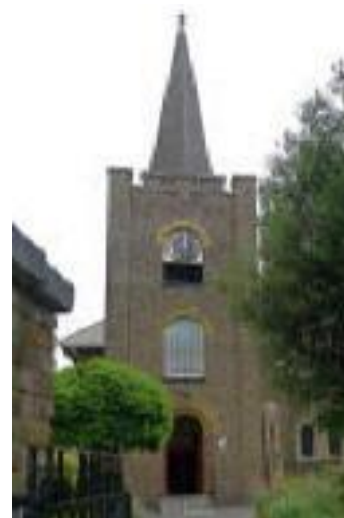
St Dunstan's Church Feltham

Seeking to know God and to make God known to others